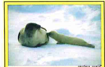
Harp Seal: Nursing Pup