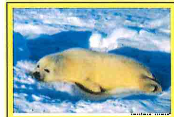
Harp Seal Pup: Sleeping on the Ice

Harp seals are sometimes called saddleback seals because of the dark, saddlelike marking on the back and sides of their light yellow or gray bodies